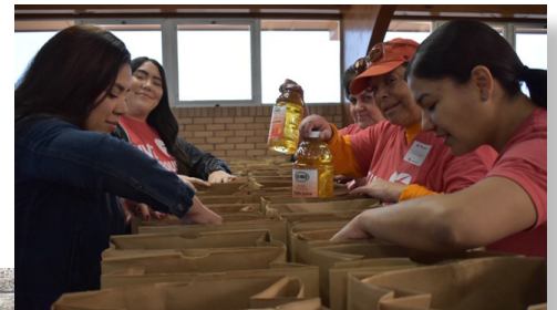
Katie's Pantry Community Event

Our Branch Operations Team participates in community outreach programs annually. They call their team BRAVO ( BR anch A ctivity V olunteer O pportunities). This year they helped distribute food to those in need at Katie's Food Pantry. They also took part in Shoe Me the Love where they collected shoes that were then donated to the children at the Child Crisis Center. BRAVO team!