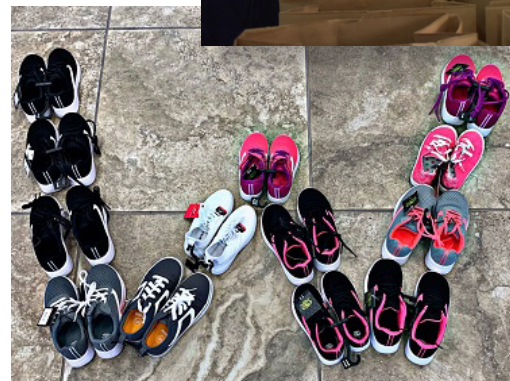
Shoe Me the Love