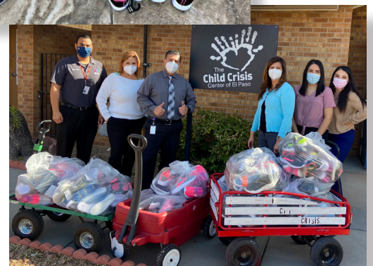
Shoe Me the Love