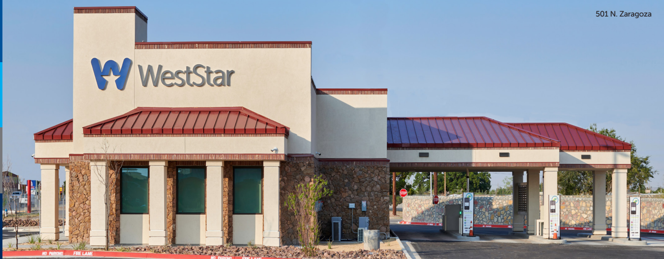
501 N. Zaragoza

Our Ysleta branch was relocated in August to what we are calling our Zaraloo branch to 501 N. Zaragoza. Our new location has the same friendly team members, providing you the same quality service you have come to expect. And now, you can enjoy all those same things in our new branch, specially designed with you in mind. Featuring a modern design and open floor plan, business concierge area for commercial clients, improved technology for a better client experience, three drive-up lanes, and a full-service ATM.